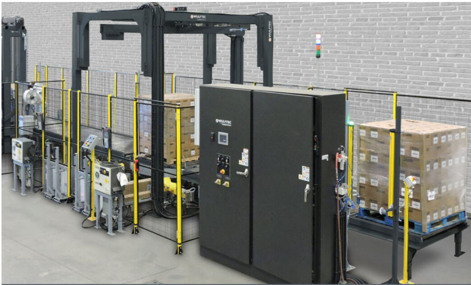
Automated Pallet Wrapper

Once goods-to-person picking tasks are completed, Matthews manages the fully automated delivery of cases and pallets to the dock. This is where, for the first time since the clean room, human employees will touch them for loading into trucks.