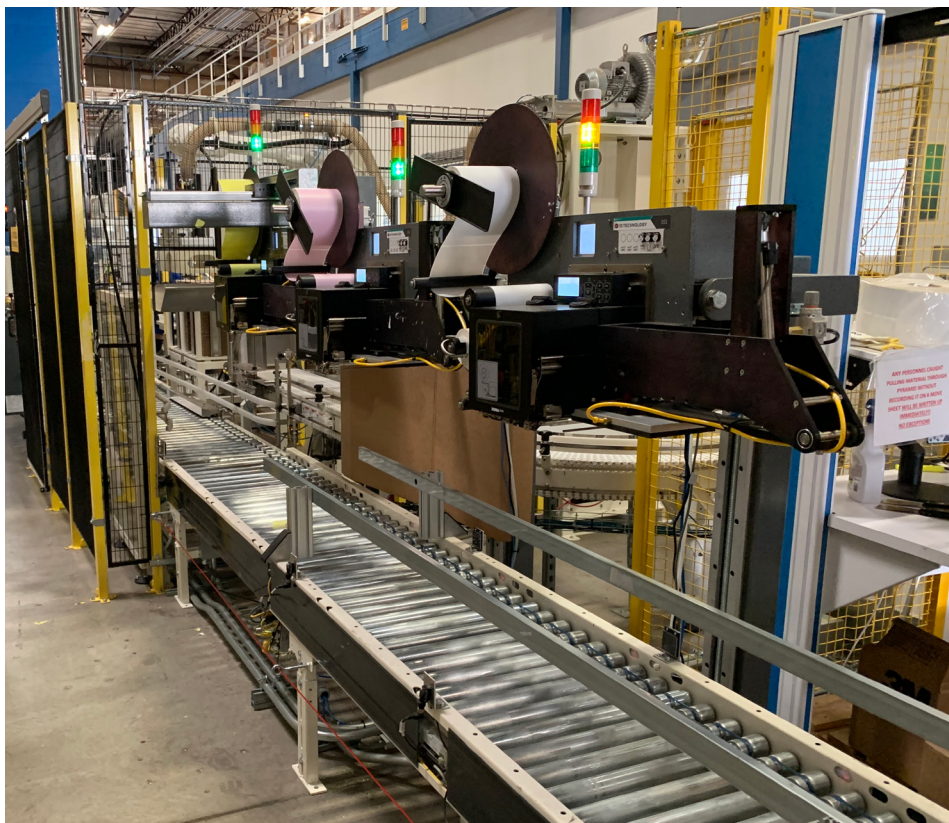
Print and Apply Labeling Line

An automated print and apply (PANDA) line labels empty cartons after they exit a carton erector. Matthews' WES controls the PANDA process using the customer's order data.