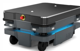
MiR250 Cart Carrier Available for MiR250