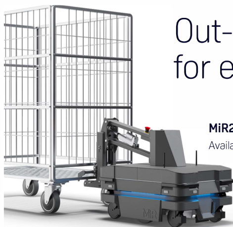
MiR250 Hook Available for MiR250