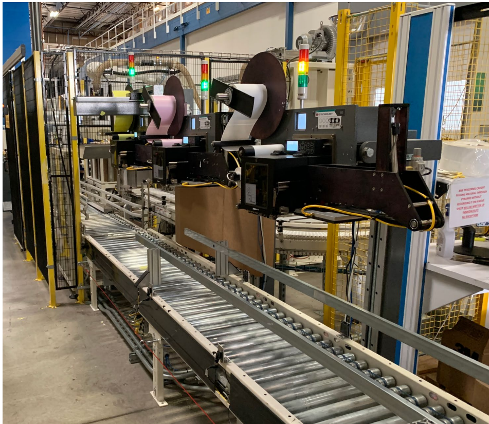
Print and Apply Labeling Line

An automated print and apply (PANDA) line labels empty cartons after they exit a carton erector. The Pyramid WES controls the PANDA process using the customer's order data.